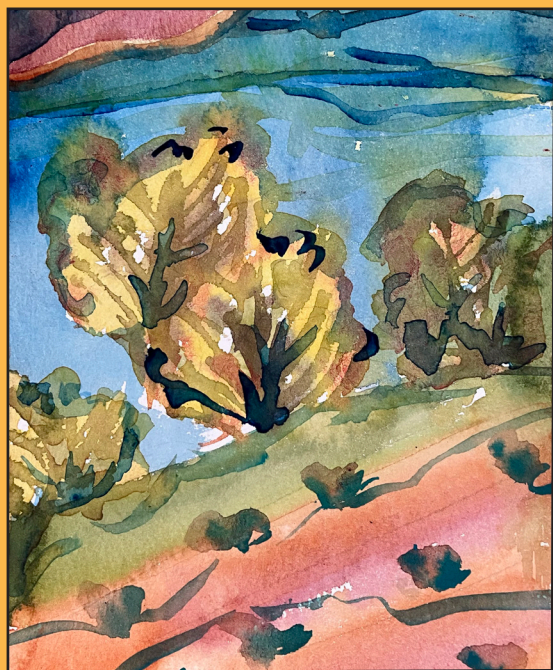
Jane Kramer - studio #5